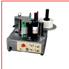
Abb. zeigt optionalen Etikettierer