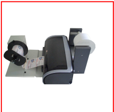
Abb. zeigt ILP mit Aufwickler